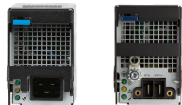
Arista 7300X Series Power Supplies

The AC power supplies are highly efficient in both platinum or titanium climate saver rated options and have an efficiency of over 93% with single stage conversion to the internal DC voltage. The DC power supplies require inputs at -48V DC to deliver up to 3000W. The 7300 Series uses multiple small power supplies which allows for incremental provisioning and smaller input circuits. Variable power supply fan speeds ensure power supply efficiency is optimized and reduces noise in data center environments.