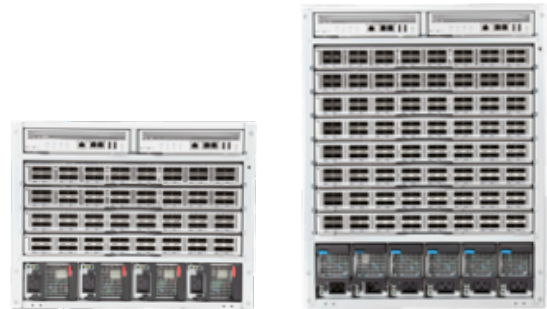
Arista 7300X Series Chassis

The midplane is completely passive and provides control plane connectivity to each of the fabric and line card modules. The system is optimized for data center deployments with front-to-rear and rear to front airflow options.