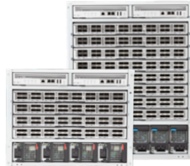
Arista 7300X Series Modular Data Center Switches

With reversible front-to-rear or rear-to-front airflow, redundant and hot swappable supervisor, power, fabric and cooling modules the system is purpose built for data centers. The 7300 Series is energy efficient with typical power consumption of under 3 watts per 10GbE port for a fully loaded chassis. All of these attributes make the Arista 7300 Series an ideal platform for building reliable, low latency, resilient and scalable data center networks. Combined with Arista EOS the 7300 Series delivers advanced features for big data, cloud, virtualized and traditional designs.